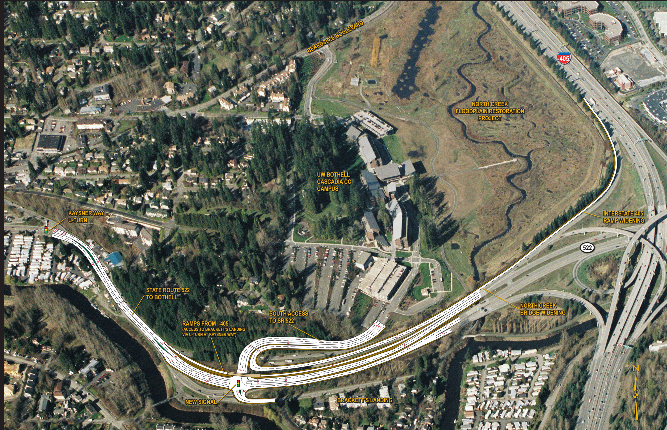
SR522 South Access – University of Washington, Bothell and Cascadia Community College Campus